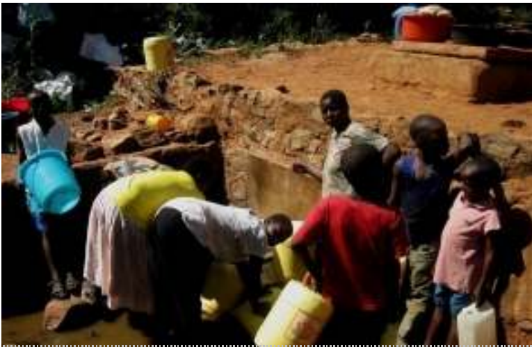
Women and children line up to fetch water and to wash clothes.