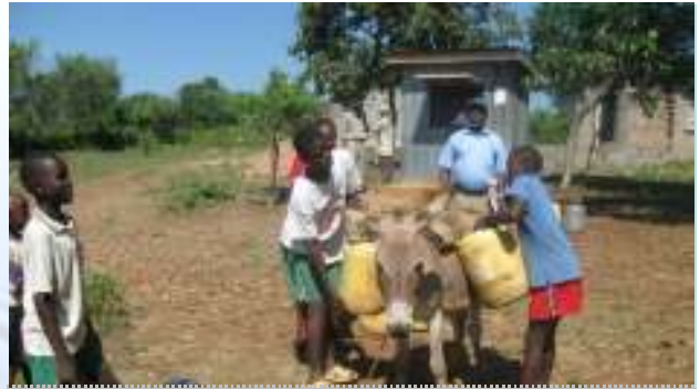
Asengo youth loading a donkey with water at the water kiosk. Currently the water is not treated.